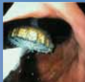
Bottle cap retrieval with Roth Net® retriever

securely extracting foreign bodies past the cricopharyngeus