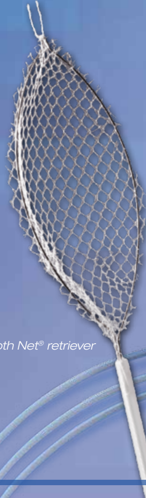
Roth Net® retriever