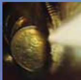
Multiple coin removal with Roth Net ® retriever