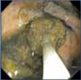
Roth Net® Platinum® retrieval of large polyp

allow continued examination with easy visibility through a more transparent net material