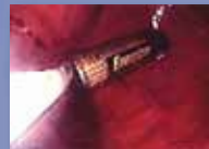
AA battery retrieval with Roth Net ® retriever - maxi