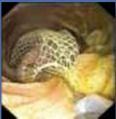
Roth Net® retrieval of tissue sample