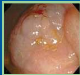
Submucosal lift prior to snare positioning