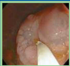
Submucosal bleb created with iSnare® system