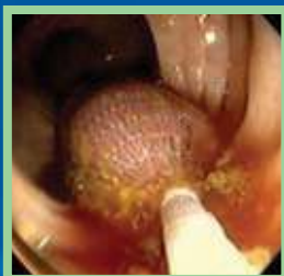
Roth Net® retrieval of large polyp