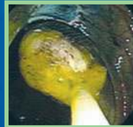
EMR specimen removal with Roth Net® retriever