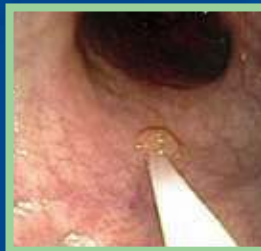
Cold snaring with the Exacto™ snare