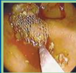
Roth Net® retrieval of multiple polyps/polyp fragments