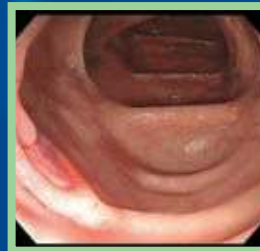
Clean cut at resection site with Exacto™ snare