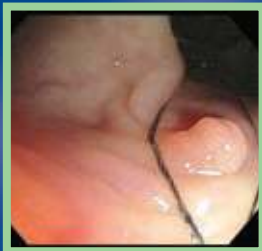
Placement of the Exacto™ snare around polyp