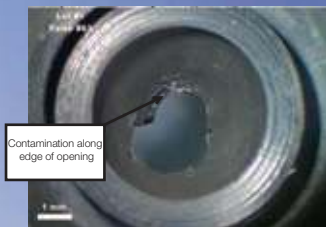
Fig 1.2 - Valve observed during microscopy demonstrates wear and damage after use, manual cleaning and high-level disinfecting. Note the presence of contamination along edge of the opening.

(Figure 1.2-1.4 taken from David M. Parente, BS, BA, MBA, "Could Biopsy Port Valves be a Source for Potential Flexible Endoscope Contamination," Infection Control Today , Volume 11, No. 6, (June 2007).