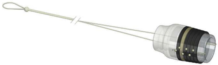
HIGH RETENTION BANDS