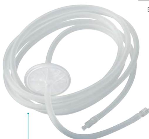
ENDOFLOW CO2 CO2 Insufflator Tubing Set