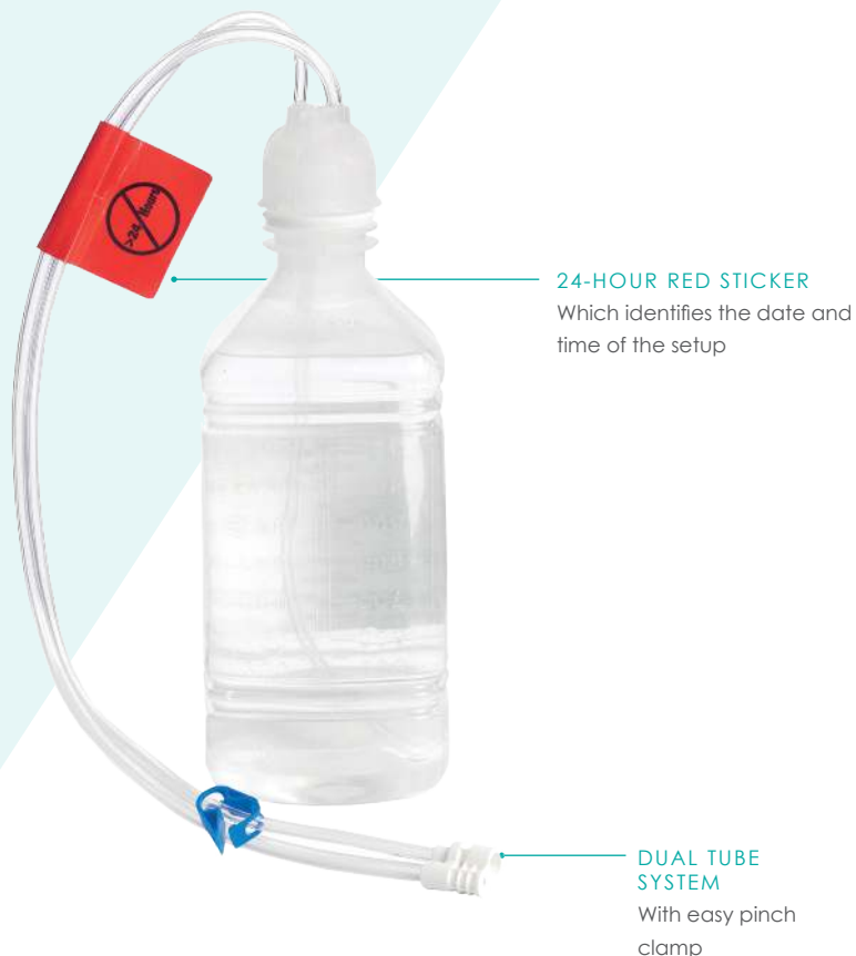
24-HOUR RED STICKER Which identifies the date and time of the setup