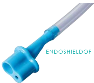
CONTROL VALVE ON CO2 CONNECTION PORT

Fully disposable 24-hour water bottle caps with CO2 compatibility. Quick, easy, reliable and great value-for-money!