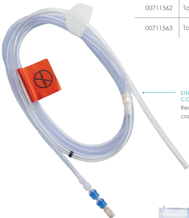
SINGLE USE CONNECTOR Reducing the risk of cross-contamination