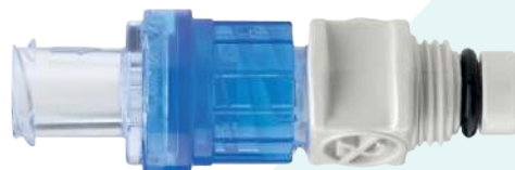
TORRENT® SCOPE CONNECTOR FOR PENTAX SCOPES