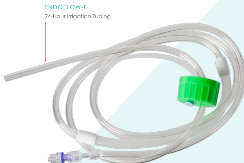
ENDOFLOW-F 24-Hour Irrigation Tubing