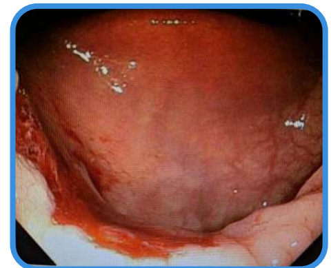
Fig. 2: Clean resection site with the CoinTip snare