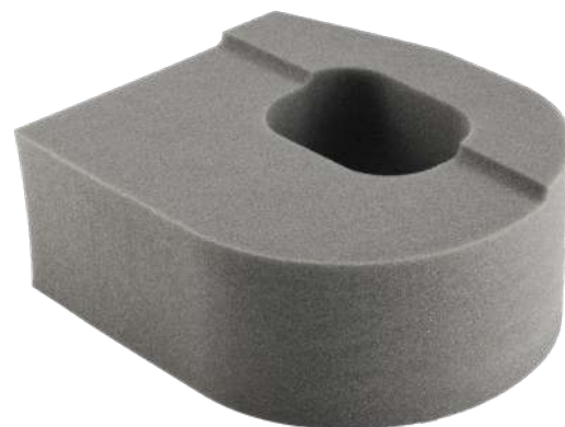
BOOST™ HEAD POSITIONER