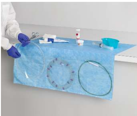
MIO® ON COUNTER

“Device access and organisation made easy when you most need it”