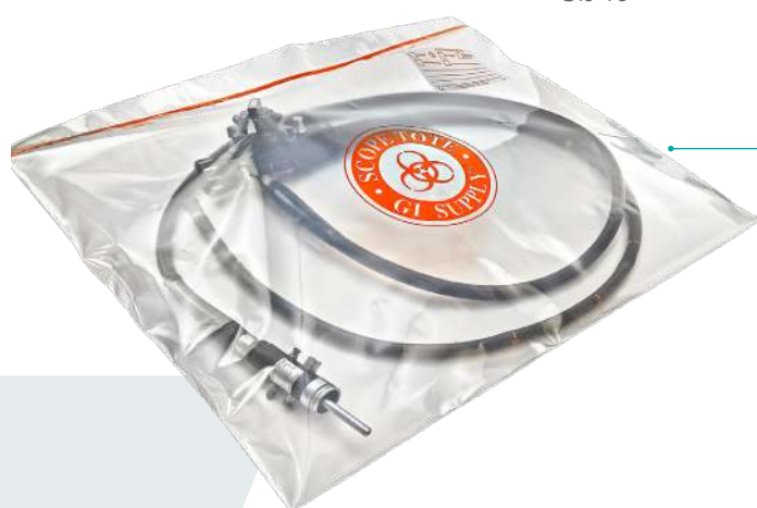
SCOPE TOTE BAG

The Scope Tote Bag is a transparent 24" X 20" re-sealable bag that easily holds all types of endoscopes as well as other types of soiled medical equipment - neatly, clearly and compactly.