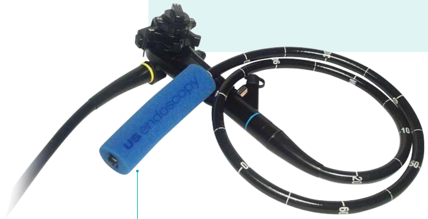
ENDO-BOOT™ ON ENDOSCOPE