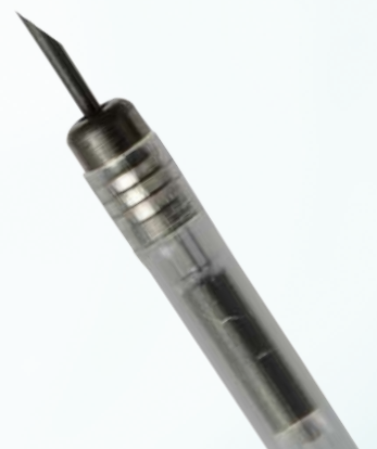
AG-5082-2423-2304 EcoClick Injection Needle