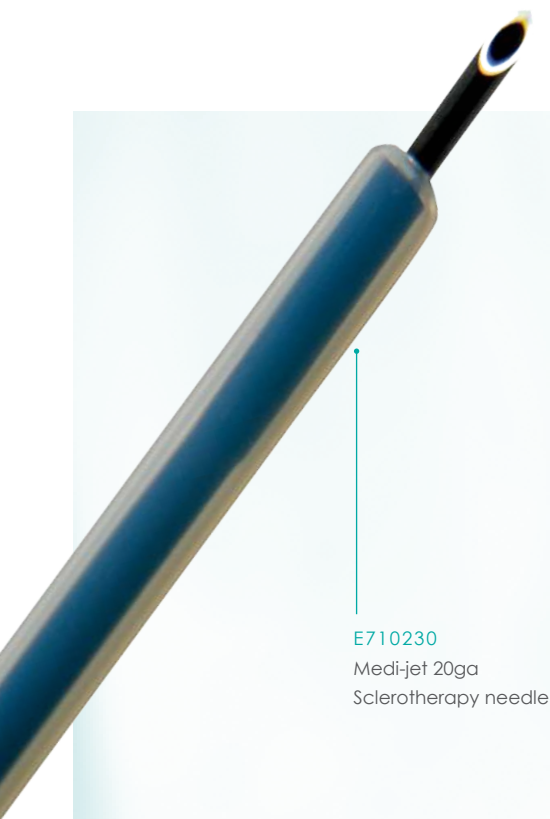
E710230 Medi-jet 20ga Sclerotherapy needle